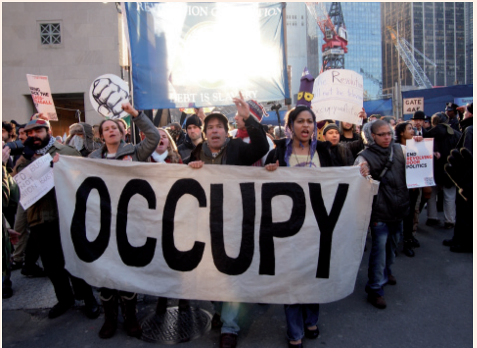
Occupy Demonstration against the financial system New York, New York, 12|12, 2011