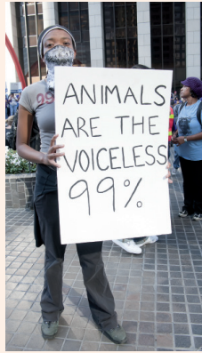
Occupy - London, St. Paul's Cathedral, Demonstration 10|19.