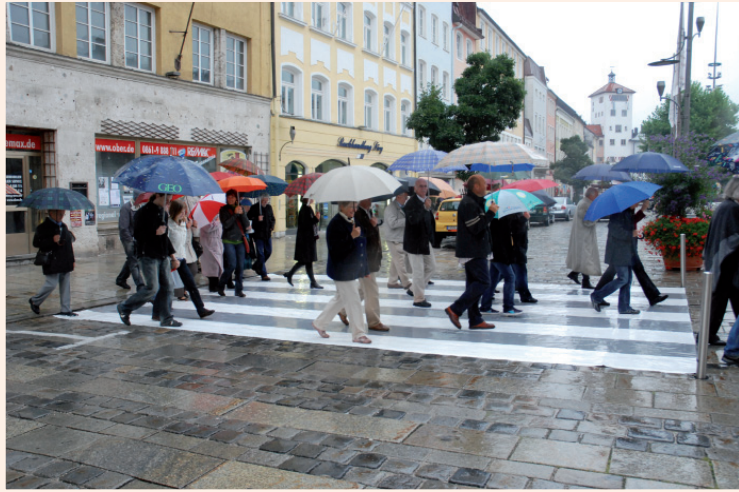
Euro stripes - Crosswalk Department for public appearances Intervention Traunstein, Germany, 2008