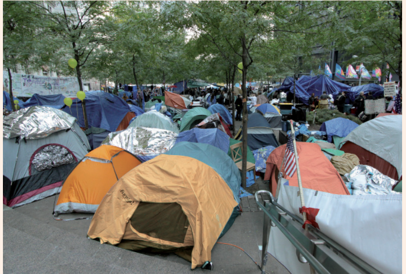
Occupy Wall Street Camp in Zuccotti Park, Financial district, New York, 10|21, 2011

Occupy Wall Street [OWS] grew in force by channeling and exposing existing discontent with these conditions. At the same time the movement worked to bring the sorrow and stigma of poverty out of private lives to the streets, and to make these both visible as physical presences. “We are the 99%” were the audio-visual hallmarks of the movement.