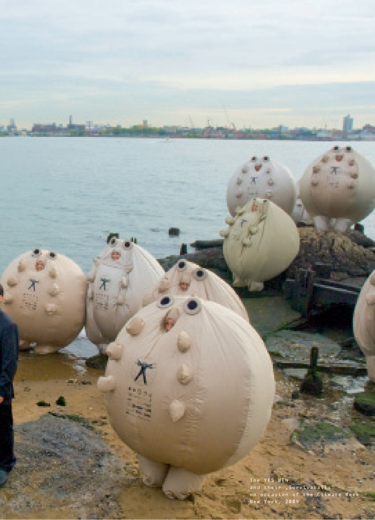
The YES MEN and their „Survivaballs“ on occasion of the Climate Week New York, 2009